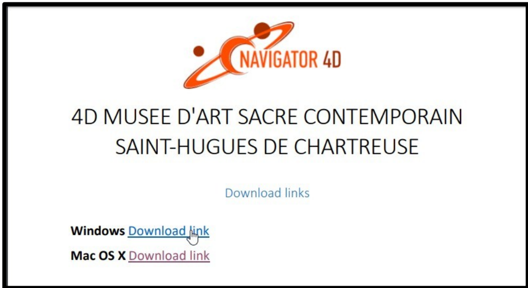
Example of PDF file with download links